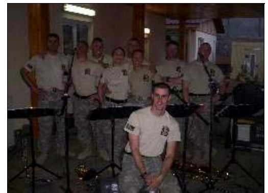
82nd Airborne Band's "Level 82" Show Band

Besides all of the musical missions at other locations, our MSTs continued musical support here at BAF. We continued our performances in all of the DFACs here on a rotating basis up to four times a week. Our Buglers and Brass Quintets continue to provide a musical tribute to our fallen comrades. Finally, this month was brought to a close as we simultaneously provided music for Memorial Day ceremonies at both HQ ISAF and BAF.