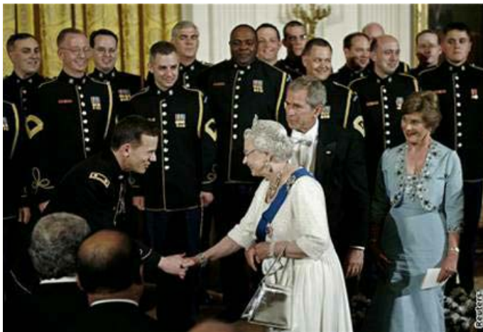
The US Army Chorus meets Queen Elizabeth II at a Whitehouse reception during her visit to the United States