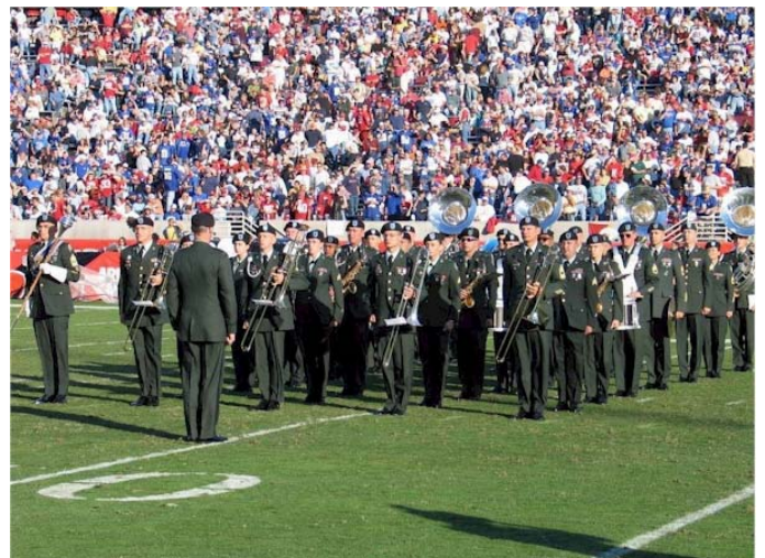
36th Army Band at Giants & Cards NFL Game

Interesting stories that represent what Army Bands do; what they've always done in support of Soldiers and Families, Recruiting, and Community Support/Protocol missions.